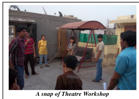
A snap of Theatre Workshop

In pursuit of promoting art, culture and language, including Bhojpuri and the official language Hindi Rangashree undertook two measure activities. The first was publication of the a special issue on Bhojpuri Street Plays i.e. 8 th issue of VIBHOR a research journal exclusively on Bhojpuri theatre and the second was promoting Hindi in a national University Jamia Millia Islamia by translating its voluminous Annual Report in Hindi in a tight time frame.