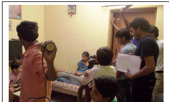
Film Shooting of “Dadi Maa”

Old and elderly of our family are the treasure of experience. Having spent their lives in looking after