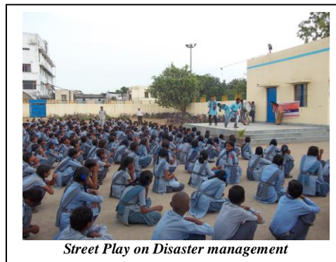
Street Play on Disaster management