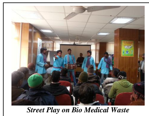
Street Play on Bio Medical Waste

All the issues, pertaining to the objective of creating awareness on proper segregation at source itself and disposal of the Bio Medical Waste ,were emphasized, in the play.