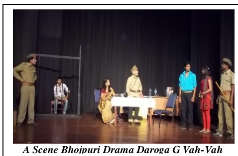
A Scene Bhojpuri Drama Daroga G Vah-Vah