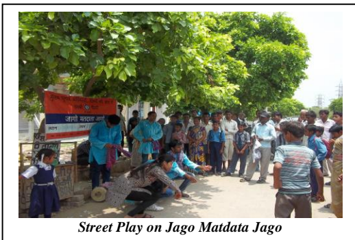
Street Play on Jago Matdata Jago