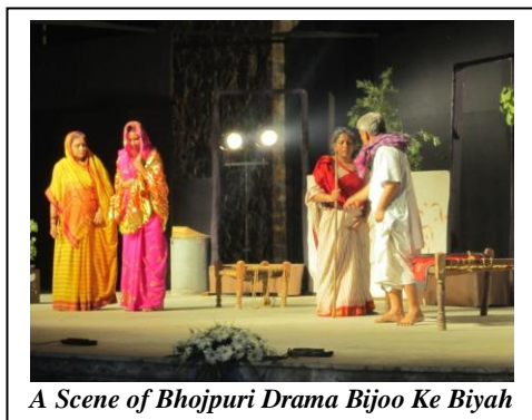
A Scene of Bhojpuri Drama Bijoo Ke Biyah